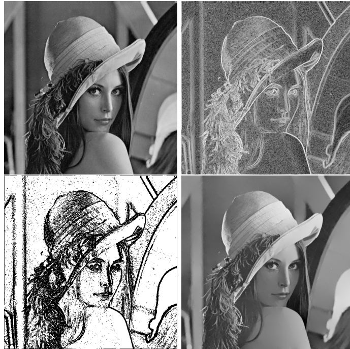
Fig. 2. Top: Left: Original Lena image; Right: Singularity exponents estimated using the Local Correlation Singularity Measure; they are represented using an inverse grayscale palette (the brightest the smaller, so more singular). Bottom: Left: MSC, defined as \{h < -0.5\} ; it comprises 30% of the points of the image; Right: Reconstruction. Some details are missing due to the lack of capability of the method to capture every UPM point; however, the reconstruction is of high quality (24.5 dB).