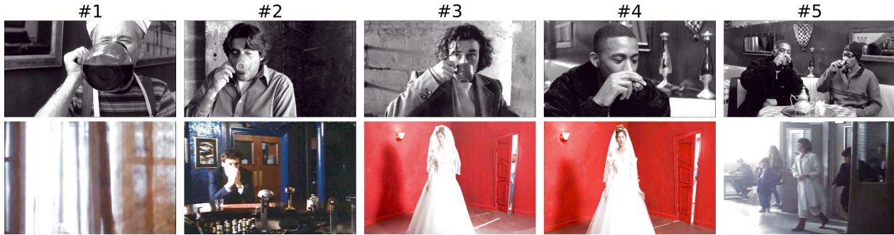
Figure 4. Frames of the top 5 actions detected with our ASM method for the “drinking” (top row) and “Open Door” (bottom row) actions.