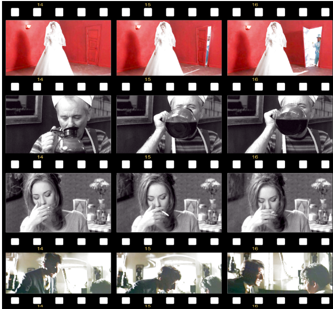
Figure 5. Frames of automatically detected test actom sequences.