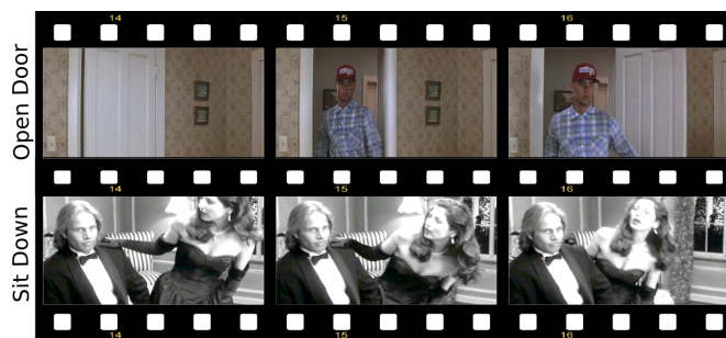
Figure 1. Examples of actom annotations for two actions.

Many actions can be naturally defined in terms of a composition of simpler blocks (see figure 1). We can observe that the displayed actions are easy to recognize given such a sequential description. Obtaining this decomposition of actions in atomic units is challenging, especially in realistic videos, due to viewpoint, pose, appearance and style variations. Furthermore, these atomic action units are action dependent and can be motions, poses or other visual patterns [20]. Therefore, many successful approaches for real-world video data avoid this decomposition and model an ac-