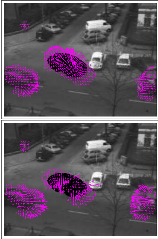
Figure 2: Missing data: D.A. (top), H.&S. (bottom).