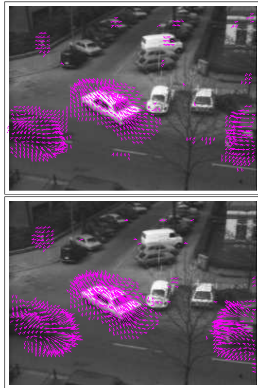
Figure 3: Result with gradients set to zero on frame 5 (top) and with gradient available (bottom).

H.&S. method is no more able to provide any result in that case, conducting to a discontinuity in the output.