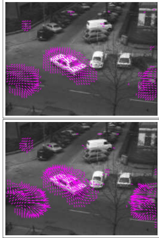
Figure 1: Result on frame 5: D.A. (top), H&S (bottom).

In a first experiment, we compute the optical flow on the sequence using the Data Assimilation method (D.A.). The Horn & Schunk method (H.&S.) is also applied and results, on the fifth frame, are displayed