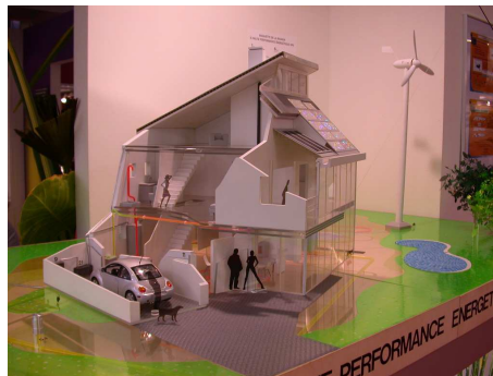
Figure i : The Ener+ house small scale model.

The Energy Positive House Ener+ The energy positive house Ener+ project 1 described technically in (21), aims to design a family size house, represented in Figure i, connected to the electricity grid that will produce enough energy to meet at least its own consumption 2 . A complete numeric model of the target house was set up in TRNSYS with 14 temperature zones in the Type56 description (22). Several scenario were ran for a location in Lyon-France where the climate is temperate and sunny 3 . The weather data input were from Typical Meteorological Year statistical hourly values.