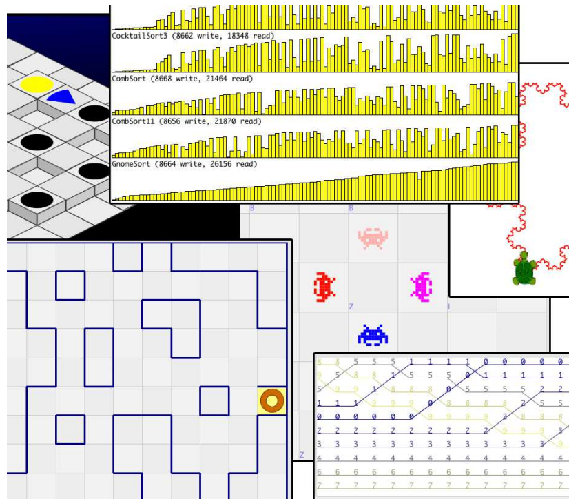
Figure 2: Visualizations of different existing micro-worlds (from left to right and top to bottom): LightBot, Sorting world, Turtle world for Recursivity, Buggle world for labyrinths and initiation exercises, and another visualization of the sorting world.

different kind of maze. Students have to implement the algorithm in order to make their player escapes the maze. A snapshot of this lesson is presented in the bottom left part of Figure 2.