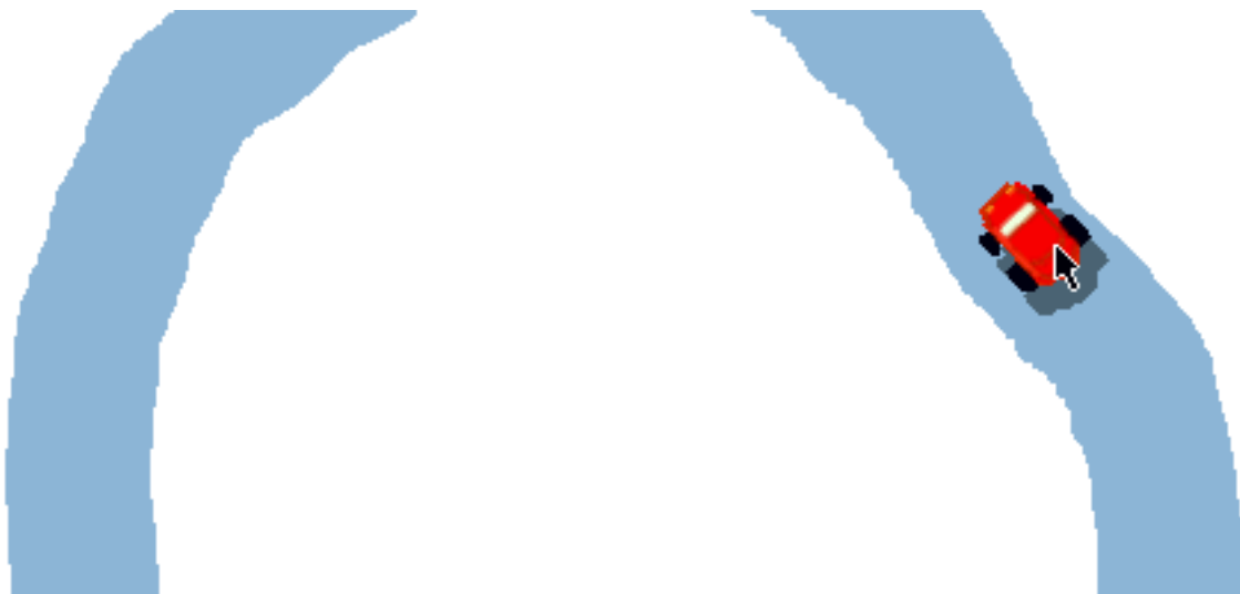
A Squeak Car

So, now go forward some slides to the Squeak for Kids project. A typical example of a project that kids will build with Squeak is the Car: A small painted car is programmed to be driven by a steering wheel and later, even has the ability to follow the road all by itself.