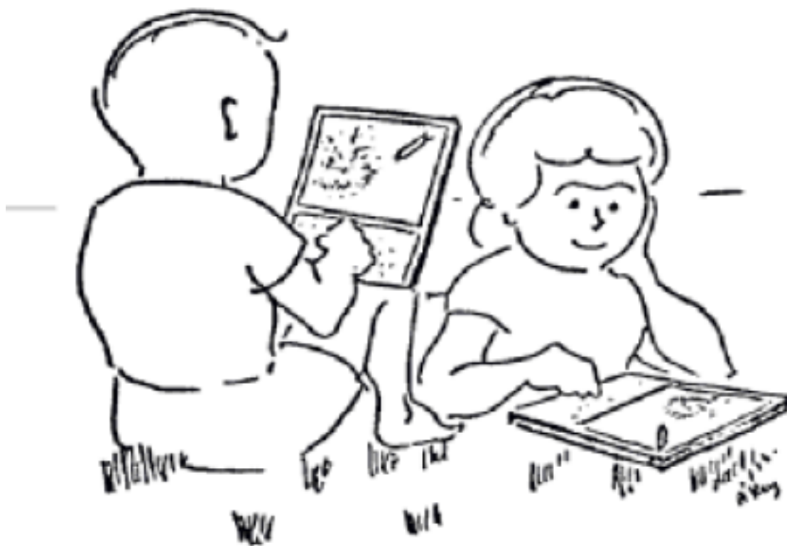
Kids using the Dynabook (ca. 1968)

So, he got an idea. A crazy one: Why not build a computer that is small enough to be carried around. It should have the size of a notebook, weighting around two pounds. It should have a graphical display, have enough memory to store a couple of books. It even could have a harddisc. A small one. Keep in mind that harddiscs at that time had the size of a refrigerator. A true Personal Computer. Build for kids. Codename: Dynabook.