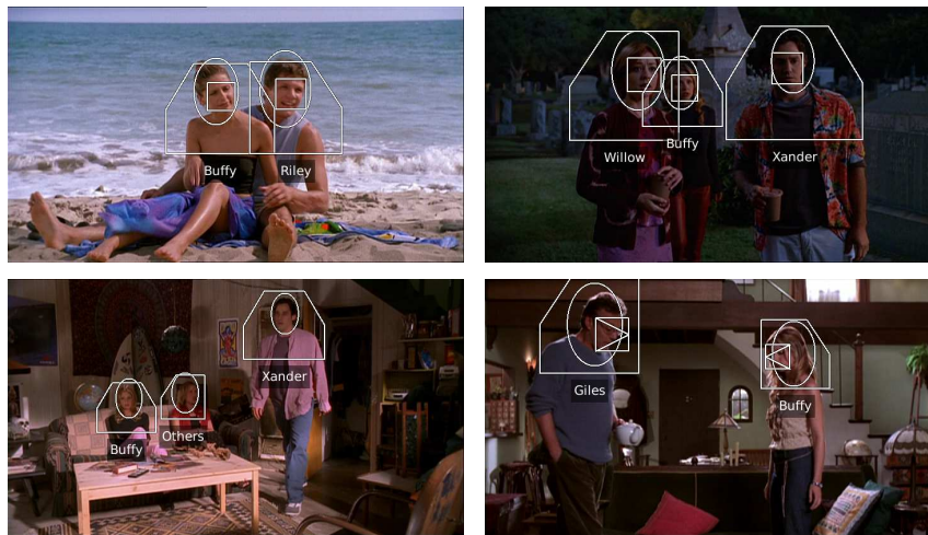
Figure 2: Typical examples for correct final detections and character identifications.

Conclusion. Good detection and recognition results were obtained with a system that combines different body part detectors and a Bag-of-Features based character recognition. Especially the combination of different body parts helps to improve the overall human detection performance. The character identification module worked well on the test sequence, although less sophisticated methods for the clustering ( k -means) and the feature extraction (dense sampling) has been employed. Again, the combination of the votes from the different body parts helps to improve the final results.