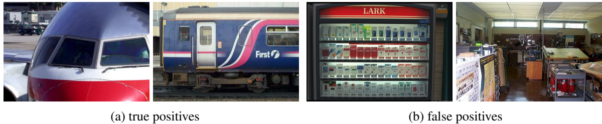
Figure 3. Sample vehicle window and machine images classified by our semantic hierarchic classifier as containing a window . Training was performed on VOC'06 images with the original annotations.

screen” and “windshield” queries and manually validating the returned images. For the negative set we have collected 120 images retrieved with the “machine” query. Section C of table 1 shows the results for these test images; training was performed on the VOC'06 images with the original labels. For the OAR and AVH methods post-classification reasoning was performed (“if there is a car or bus than there is a window”). The SSH classifier could not perform the task as it was trained without meronymy/holonymy relationships. Our ESH classifier shows significantly better performance than the methods only extended with reasoning. This confirms that the classifier was able to generalize over the windows of cars and buses. Fig. 3 illustrates examples for detecting individual windscreens and windows of different vehicles. Even some false positives on window-like structures were observable, see fig. 3. We conclude, that our classifier is able to learn the generalized visual appearance of unseen object classes through inference.