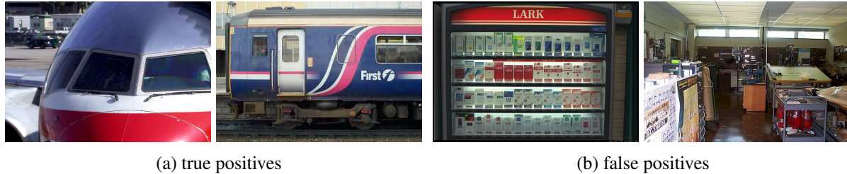
Figure 3. Sample vehicle window and machine images classified by our semantic hierarchic classifier as containing a window . Training was performed on VOC'06 images with the original annotations.

screen” and “windshield” queries and manually validating the returned images. For the negative set we have collected 120 images retrieved with the “machine” query. Section C of table 1 shows the results for these test images; training was performed on the VOC'06 images with the original labels. For the OAR and AVH methods post-classification reasoning was performed (“if there is a car or bus than there is a window”). The SSH classifier could not perform the task as it was trained without meronymy/holonymy relationships. Our ESH classifier shows significantly better performance than the methods only extended with reasoning. This confirms that the classifier was able to generalize over the windows of cars and buses. Fig. 3 illustrates examples for detecting individual windscreens and windows of different vehicles. Even some false positives on window-like structures were observable, see fig. 3. We conclude, that our classifier is able to learn the generalized visual appearance of unseen object classes through inference.