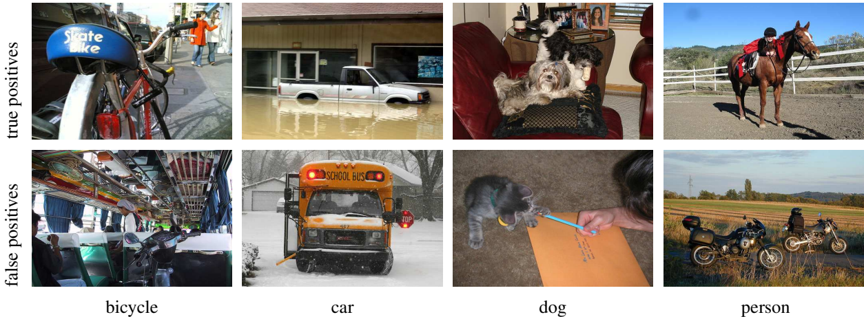
Figure 1. Sample PASCAL VOC'06 images classified with our semantic hierarchic classifier.

experimental section, incorporating the semantics into the knowledge representation leads to better recognition accuracy than relying only on straightforward reasoning, as it also allows to discover additional visual cues that would be missed otherwise. Semantic hierarchies have proved to be useful for automatic image annotation [14]. We use them to combine discriminative classifiers and thus choose a different strategy for exploiting their structure. We will demonstrate that this introduces some additional features for object detection, in particular it allows to give sensible answers in situations of uncertainty and to learn new classifiers using inference. We also go beyond the ISA relationships taking advantage of PARTOF and MEMBEROF relationships.