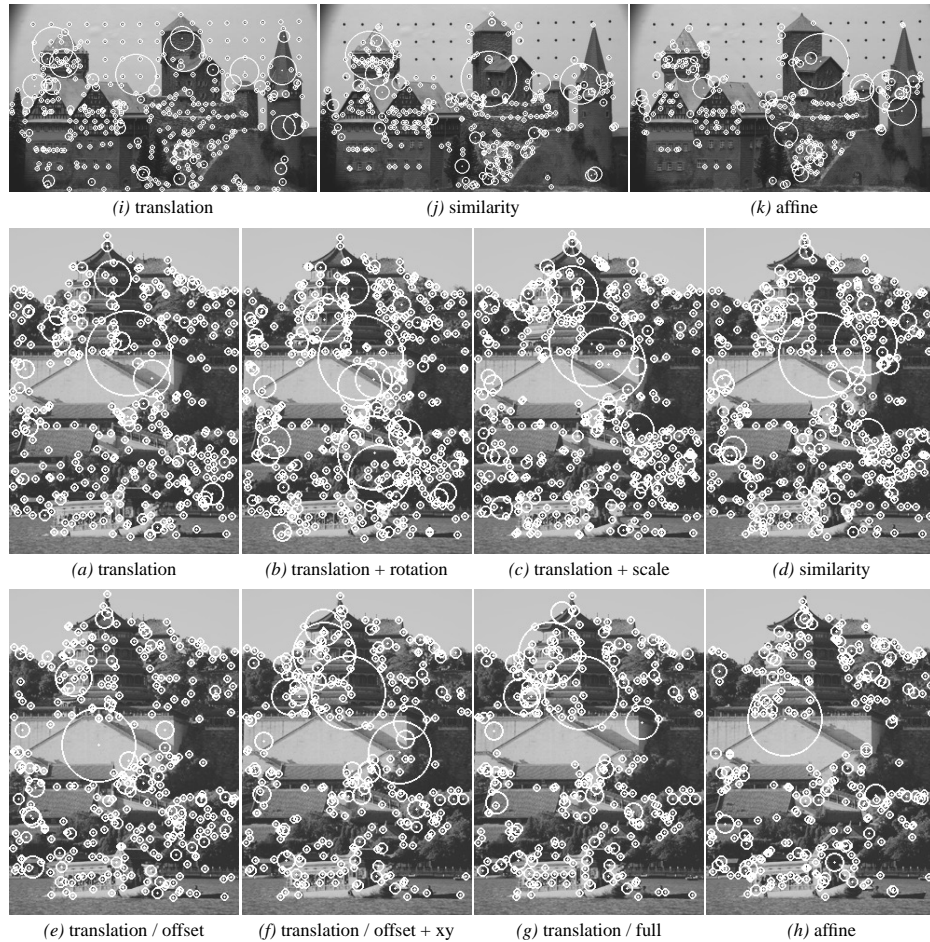
Fig. 3. Examples of keypoints from the CMU and Summer Palace (Beijing) test images, under various motion and illumination models. The prefilter and integration windows had \sigma=2 pixels, \alpha = 0 , and non-maximum suppression within 4 pixels radius and scale factor 1.8 was applied. Note that, e.g. , ‘affine’ means ‘resistant to small affine deformations’, not affine invariant in the sense of [32, 24, 25].