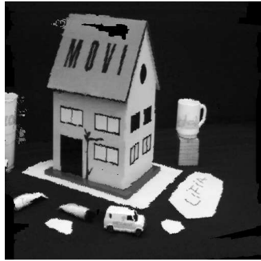
The synthesized & filtered image.