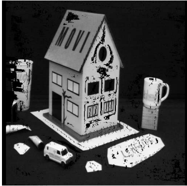
Points of im1 for which we found a correspondent in im2 .