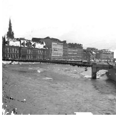
The synthesized & filtered image.