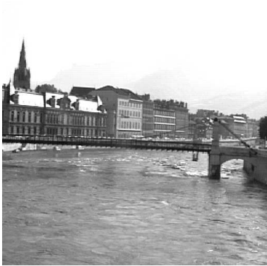
The real image.