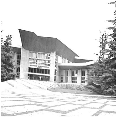
The real image.