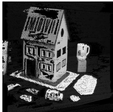
The synthesized image.