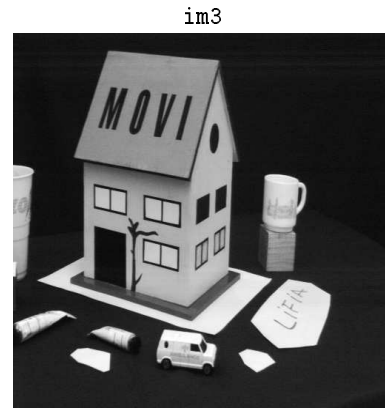
The image to synthesize