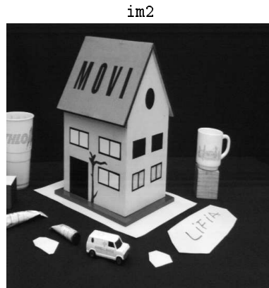
The 2 reference views