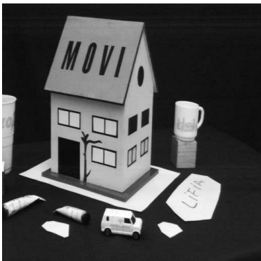
The real image.