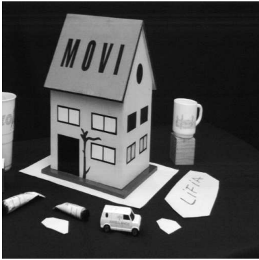
The real image.