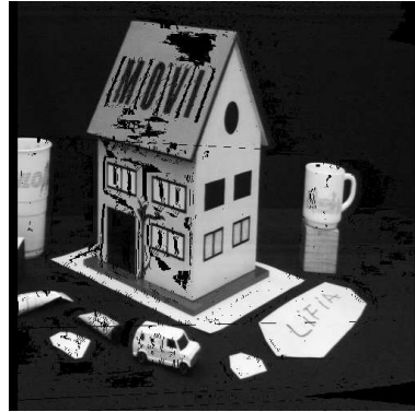
Points of im2 for which we found a correspondent in im1 .