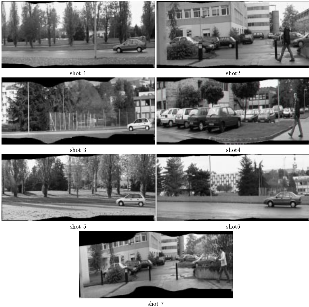
Figure3. Panoramic view built for each extracted shot

In fact, we have exploited this technique to process each shot of the considered video example. The obtained panoramic views are displayed in Fig. 3. No misalignment can be visually detected, what ensures the reliability of the indexing of these mosaics relying on local properties of the intensity function as shown in the next section.