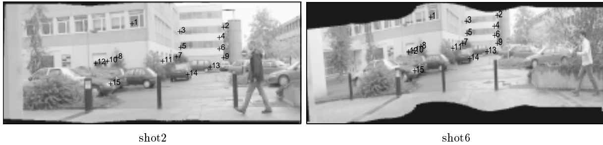
Figure4. Examples of matching and correct correspondence (100% of correct matches in this case)