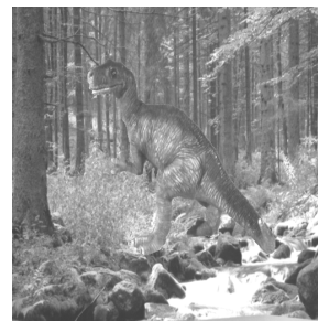
Figure 3: A 3D object in front of cluttered background.

Experiments first show that the recognition rate increases for the test set of 100 aerial images (taken from