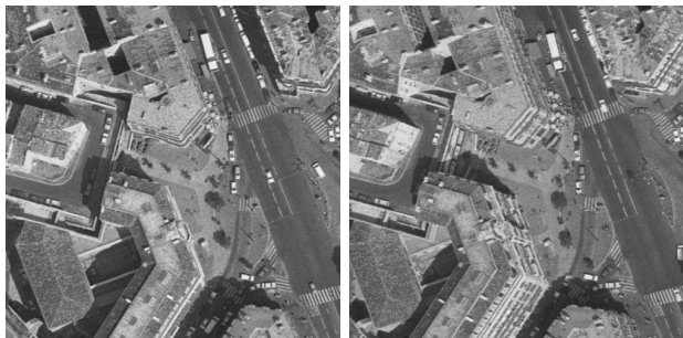
Figure 2: The left image shows an image of the test set; the right one is the corresponding image of the database. Notice that buildings appear differently because viewing angles have changed and cars have moved.

The test set consists of 100 aerial images taken from a different point of view. The left image of figure 2 shows an image of the test set and the right image is the corresponding image of the database. Notice that buildings appear differently because viewing angles have changed and cars have moved. Another test