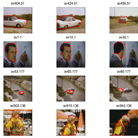
Figure 3. Subset of tracked object models

Gaussian models. Gaussian mixtures are sufficiently general to model arbitrarily complex, non-linear distribution accurately given enough data [7]. When the data is limited, the method should be constrained to provide better conditioning for the estimation. The various possible constraints on the covariance parameters of a Gaussian mixture (e.g. all classes have the same covariance matrix, an identity covariance matrix, ..), defines 14 models. We have implemented the following seven models derived from the three general families of covariance forms: M_1 = \sigma^2 I and M_7 = \sigma^2 I the simplest model from the spherical family ( I is the identity matrix); M_2 = \sigma_j^2 \text{Diag}(a_1, \dots, a_d)