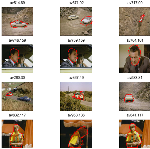
Figure 4. Subset of tracked object tests

Features. The approach is evaluated using gray and color global features resumed by histograms. The histogram approach is well known as an attractive method for object recognition because of its simplicity, speed and robustness. The RGB space is quantized into 64 colors, and the gray-scale one into 16 intensities. Then, the PCA was applied on the entire set of initial data of the each feature space in order to reduce their dimensionality ( d_E in table 1). This is an important step to overcome the curse of dimensionality where the number of samples of an object model is not in general sufficient to fit an optimal Gaussian mixture model.