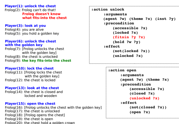
Figure 2: External bridging becomes internal

This means that, when an action is executed, the interaction KB will be updated not only with the effects of the action but also with its preconditions. And those preconditions that were not in the interaction KB before will be verbalized as in turn (9) in Figure 2.