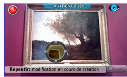
Figure 2: Pentimento game

What does the visitor do? The visitor contemplates the painting. He moves the magnifying glass on AR terminal exploring the art work. After several seconds, the visitor finds the location of the pentimentos (Figure 2). Then the visitor can discover pentimentos with his naked eye on the painting.