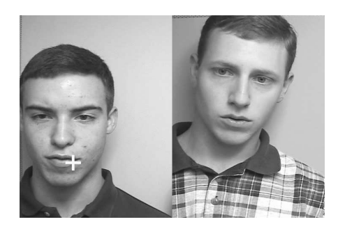
Fig. 2. Sample frame of the test audiovisual sequence. The white cross highlights the median spatial position of the video maxima.

In the third experiment we test how the learned dictionary is able to recover meaningful audiovisual patterns in real multimedia sequences. We consider a clip consisting in two persons in front of the camera arranged as in Fig. 2. One of the subjects (the person on the left) is uttering digits in English, while the other one is mouthing exactly the same words. The clip can be downloaded through http://lts2www.epfl.ch/~monaci/avLearn.html. The audio track is at 8 kHz, while the video is at 29.97 fps and at a resolution of 480 \times 720 pixels. The speaker is the same subject whose mouth was used to train the multi-modal dictionary in Fig. 1; however, the training sequences are different from the test sequence. We want to underline that such a sequence is particularly difficult to analyze, since both persons are mouthing the same words at the same time. The task of associating the sound with the "real" speaker is thus non-trivial.