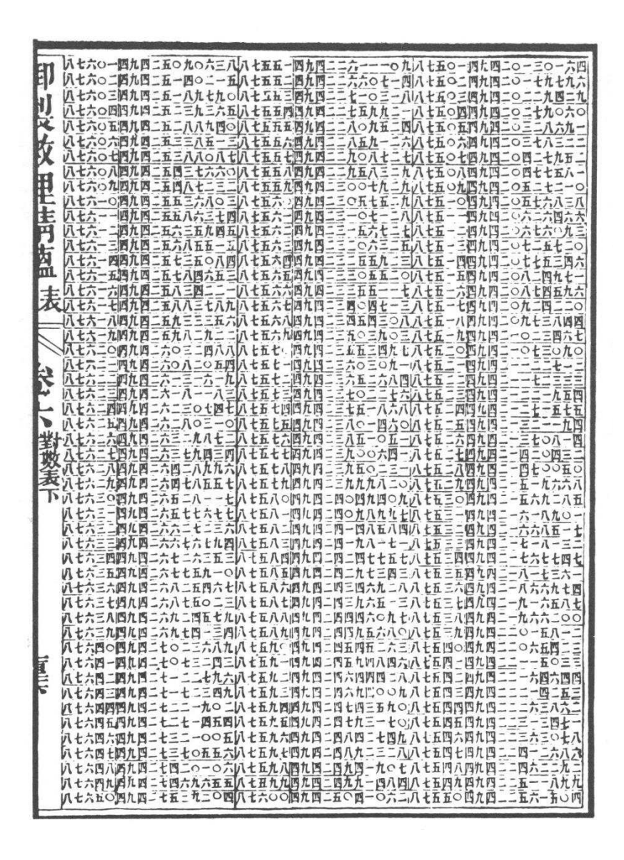
Figure 4: Menninger's table. The text on the left is partly covered but indicates that the table is part of the 數理精蘊 encyclopædia.