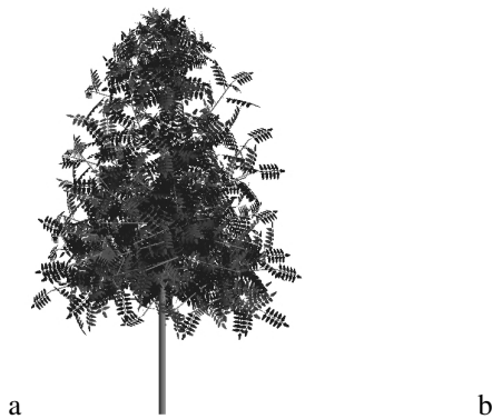
Figure 2. Simulation of acacia trees. a: tree protected from herbivore attacks, b: tree attacked three times (8,14, 20 time steps). Both trees are represented at 25 time steps.

[9]. This paper presents the coupling of an individual plant model with a simple model of herbivore attacks. Experimental data allow us to estimate GreenLab model parameters and reproduce tree growth, with architectural changes according to the intensity of herbivore attacks. However, due to the experimental design, the quantification of the attack intensity is not very precise. Thus measurements should be completed with data on plant growth dynamics. Likewise, definitions of the level of attack intensity should be refined, to allow us to validate this model more thoroughly.