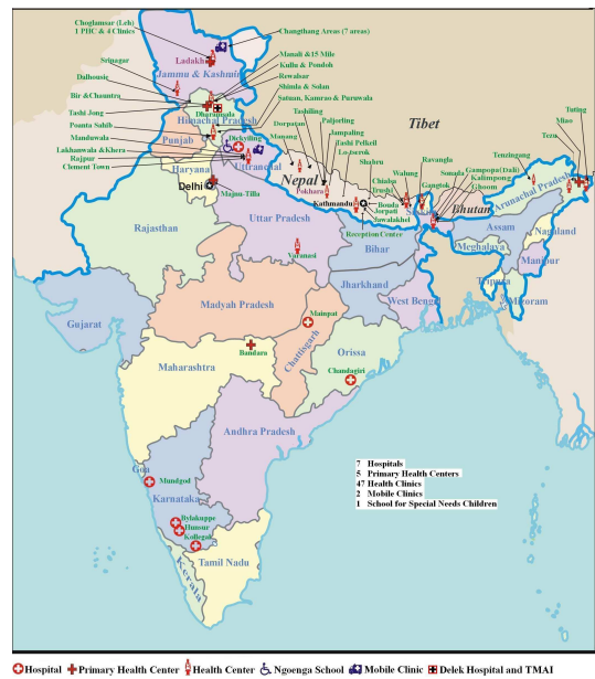
Figure 2: SMS-MobileWeb Information Flow

<name>Nexus007</name> <mobile>44771234578</mobile> <provider>BNL</provider> <entries> <entry date="2008-06-12T09:56:08.593Z"> <lat>35.54</lat> <lon>76.87</lon> </entry> <entry date="2008-06-12T09:56:08.593Z"> <lat>34.10</lat> <lon>77.37</lon> </entry> .... </report> }