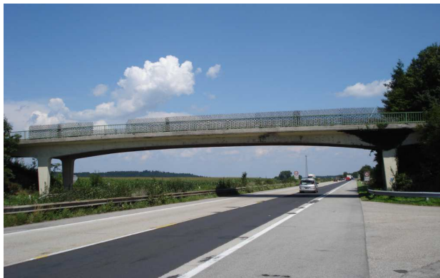
Figure 1: S101 bridge in Reibersdorf, Austria

The S101 bridge ([13]) connected Salzburg - Vienna carriage way in Austria. That is a post-tensioned concrete bridge with main span of 32 m, side spans of 12 m, and the width of 6.6 m. The deck is continuous over the piers. This bridge, constructed in 1960, has been a typical overpass bridge in Austria national highway. In the current paper, the ambient vibration data is collected on 15 sensors. The original sampling frequency is 500 Hz with 165000 time samples available. The data is decimated to 35.7 Hz and only five modes are taken into account.