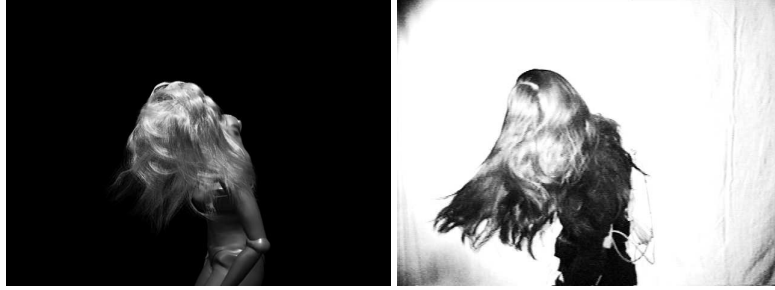
Fig. 3. Our model (left) captures both continuities and discontinuities that can be observed in real long hair motion.