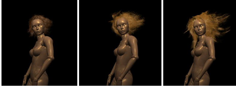
Fig. 4. Results with various hair lengths.

wisps collisions with the character (30 to 36%). The total animation times 2 (264 frames) were 3.2 hours for the short hair style and 2.9 hours for the medium and the long hair styles.