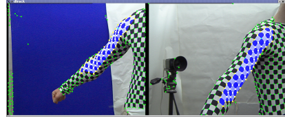
Figure 2: 3D points reprojected in the two views in yellow

a least-squares problem. We compute it by performing a SVD decomposition (cf fig 2).