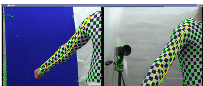
Figure 4: Joints identification of the arm

Without any occlusion our method works very well (cf fig 5). Occlusions are detected in red.