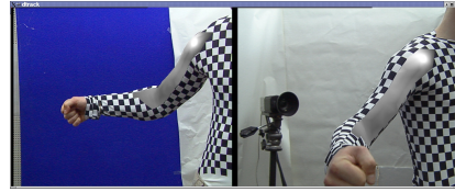
Figure 5: Example of tracked reconstructed surface without occlusion