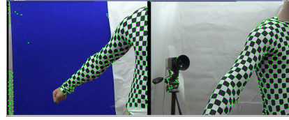
Figure 1: Interest points in green in the two views on the rest pose

We search the 3D point Q which minimizes distances between the projection rays given by the image points of N views [?]. We have to solve