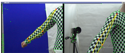
Figure 4: Joints identification of the arm

Without any occlusion our method works very well (cf fig 5). Occlusions are detected in red.