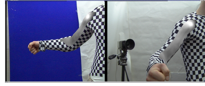
Figure 5: Example of tracked reconstructed surface without occlusion