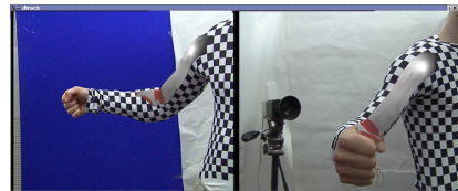
Figure 6: Invalid tracked surfaces in red

We can see the validity criterion is pertinent, and even before a point disappear totally, it introduces spatial incoherences (cf fig 6). After this step the fist occludes the tracked points in the second view. Thus we estimate the 3D thanks to the last known distances of the reconstructed model and the other view (cf fig 7). We combine 3D reconstruction and 2D line tracking to guide the tracking of points where they will not be occluded any more.