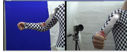
Figure 6: Invalid tracked surfaces in red

We can see the validity criterion is pertinent, and even before a point disappear totally, it introduces spatial incoherences (cf fig 6). After this step the fist occludes the tracked points in the second view. Thus we estimate the 3D thanks to the last known distances of the reconstructed model and the other view (cf fig 7). We combine 3D reconstruction and 2D line tracking to guide the tracking of points where they will not be occluded any more.