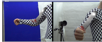
Figure 6: Invalid tracked surfaces in red

We can see the validity criterion is pertinent, and even before a point disappear totally, it introduces spatial incoherences (cf fig 6). After this step the fist occludes the tracked points in the second view. Thus we estimate the 3D thanks to the last known distances of the reconstructed model and the other view (cf fig 7). We combine 3D reconstruction and 2D line tracking to guide the tracking of points where they will not be occluded any more.