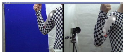
Figure 7: Reconstruction with large occlusions

We have used our reconstruction as the control polygon of a subdivision surface integrated in an arm sequence to show how to use our results in an animation software. The points we defined previously are the same used in a standard motion capture sequence. As a consequence, we only have to match them with the skeleton of the animated 3D model under the software and scale the surface using the joints, than can be done automatically. In our case, only the first