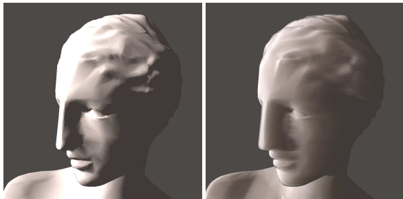
Figure 1: Marble statue without (left) and with (right) subsurface scattering.