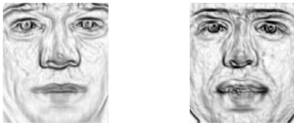
Figure 1. Opposite of the sum of the spatio-temporal gradient norm calculated on an image sequence.

where I(x, y, t) represents the grey level value, x and y the spatial components, t the temporal component and N the number of images of the sequence. \mu is a normalization term depending on the temporal sampling of the sequence and on the motion of the different features during the sequence.