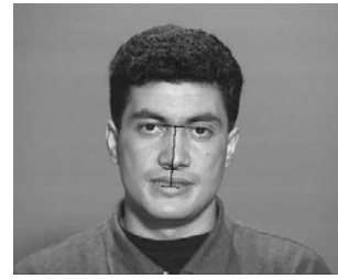
Figure 2. Results of the localization of the eyes, nose and mouth.

In next section we make use for the system of an active contour model to extract facial features boundaries: in order to use the same initialization and parameters for the active