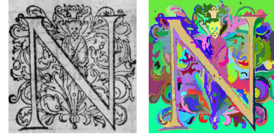
(a) Original image (b) Segmented image

1) Extraction and segmentation of images: Our aim is to catch the pure geometrical component in an image independently of texture and noise. For this, in [4], authors propose a decomposition model which splits an image into three components: the first one, u , containing the structure of the image (see Figure 3(b) for an example),