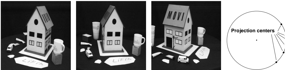
Figure 2. Example of a critical image sequence. The images are obtained while rotating about the same axis. (a)-(c) Three images of the 6-image sequence. A self-calibration was done from point correspondences of the images [21]. As expected, the result is not a Euclidean structure of the scene, since for example the estimated aspect ratio is about 2, while the true one is about 1.5. However, the recovered motion sequence is, as the original one, an orbital motion, i.e. it consists of rotations about a fixed axis. This is illustrated in (d) where a top view of the recovered projection centers shows that they lie very close to a circle.

Thus, identifying the potential absolute conics of S' is equivalent to identifying those of S and thus to determining all ambiguous Euclidean reconstructions from the sequence S ! In the following subsection we discuss how to determine the potential absolute conics of a rigid motion sequence.