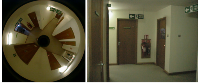
Figure 3. Stereo pair used in experiments.

Figure 2 shows the epipolar geometry (fundamental matrix), estimated by the analogon of the linear 8-point algorithm for the purely perspective case. Twenty manually selected points were used for the estimation. The estimated fundamental was also used for calibration transfer, see §4.3.