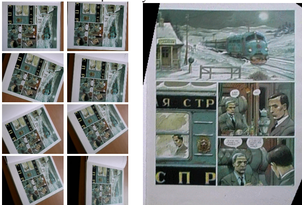
Figure 3: Left: input images. Right: rectified image.

Figure 3 shows a rectified image of the world plane, obtained from the first frame of the last row in the figure. The structure is well recovered, considering that the page of the comic book was not perfectly flat towards its left.