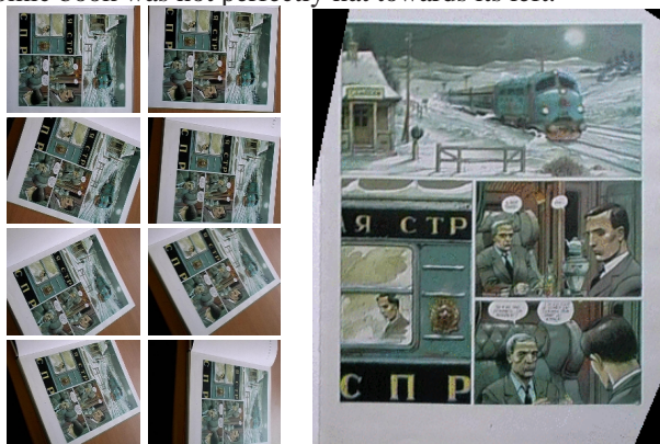
Figure 3: Left: input images. Right: rectified image.

Figure 3 shows a rectified image of the world plane, obtained from the first frame of the last row in the figure. The structure is well recovered, considering that the page of the comic book was not perfectly flat towards its left.