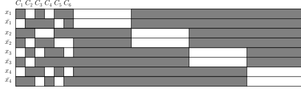
Figure 1: Proof of NP-completeness of OFF-LINE.

of p processors, with availability vectors \mathcal{S}_q , a bound n_{com} on the number of simultaneous communications, and a time limit N , does there exist a schedule that executes one iteration in time less than N ? The problem is obviously in NP: given a set of tasks, a platform, a time limit and a schedule (of communications and computations), we can check the schedule and compute its completion time with polynomial complexity.