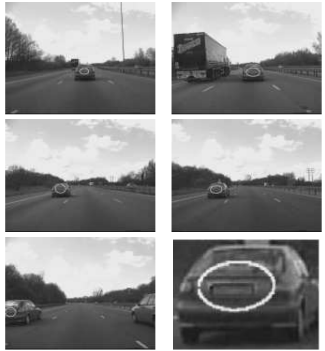
Figure 5: License plate tracking results: images 1, 187, 347, 417, 520 of the sequence, and a zoom made on image 417.

( http://www.ee.oulu.fi/~mikak/tracking/FaceColor.html ). There are some important appearance changes since the person turns around 360^\circ during the sequence. The results show that the way to update the model in order to cope with appearance changes of the target is efficient. Furthermore, the algorithm is able to track even in the cases where the person moves with changes in speed.