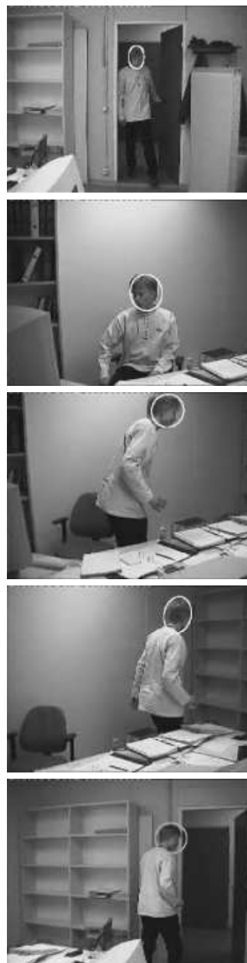
Figure 3: Face tracking results: images 1, 140, 395, 412 and 449 of the sequence.