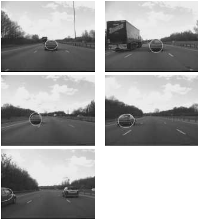
Figure 4: Car tracking results: images 1, 187, 347, 462 and 563 of the sequence.