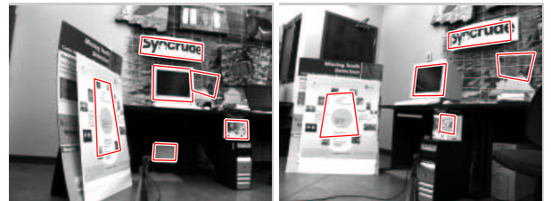
Figure 3. Tracking 3D planes. Pose accuracy experiment. video2 [1]

One of the main advantages of the proposed approach over traditional SSD tracking is that actual 3D camera pose can be tracked. This is useful for example in robotics or augmented reality applications. In the next experiment we evaluate the accuracy of tracking in an indoor lab scene tracked by a moving camera. Ground truth was obtained by measuring the camera path and performing a Euclidean calibration of the model. Figure 3 shows two tracked frames, and the sequence can be seen in video2 [1].