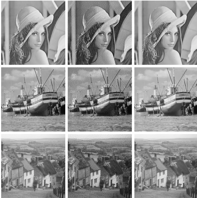
Fig. 2. From left to right: Original images, halftoned images, reconstructed images. Even though the halftoned images (center column) perceptually look relatively close to the original images (left column), they are binary. Reconstructed images (right column) are obtained by restoring the halftoned binary images. Best viewed by zooming on a computer screen.

known to contain one of each. 16 We proceed in a leave-one-out fashion, where we remove for testing one authentic and one imitation paintings from the dataset, and learn on the remaining ones. Since the dataset is small and does not have an official training/test set, we measure a cross-validation score, testing all possible pairs. We consider 12 \times 12 color image patches, without any pre-processing, and classify each patch from the test images independently. Then, we use a simple majority vote among the test patches to decide which image is the authentic one in the pair test, and which one is the