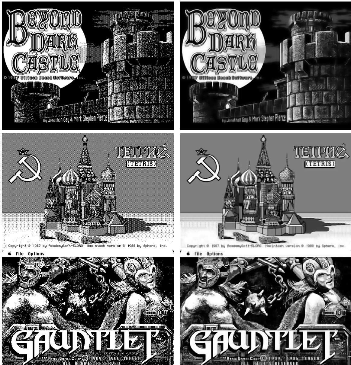
Figure 3: Results on various binary images publicly available on the Internet. No ground truth is available for these images from old computer games, and the algorithm that has generated these images is unknown. Input images are on the left. Restored images are on the right. Best viewed by zooming on a computer screen.