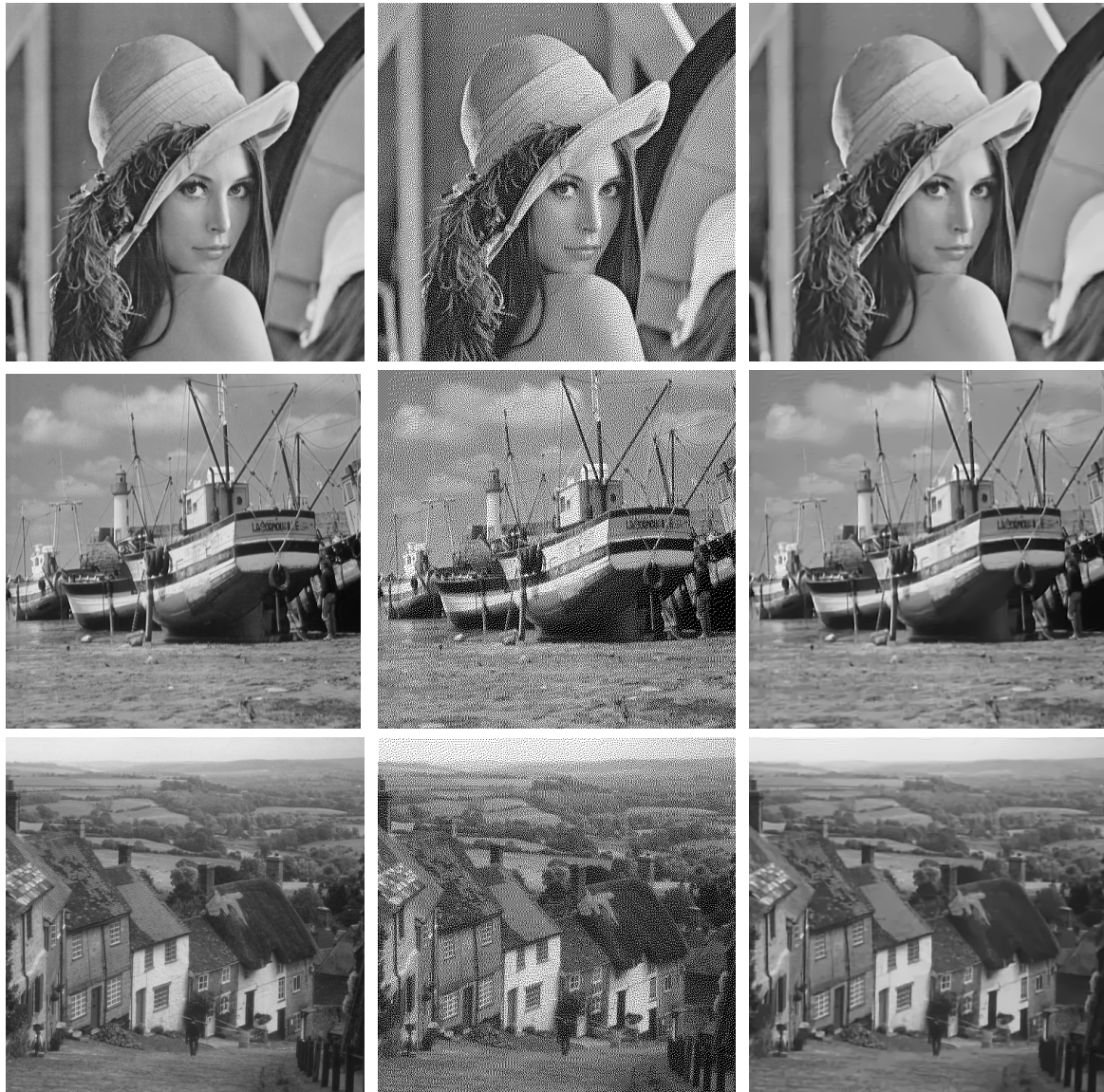
Figure 2: From left to right: Original images, halftoned images, reconstructed images. Even though the halftoned images (center column) perceptually look relatively close to the original images (left column), they are binary. Reconstructed images (right column) are obtained by restoring the halftoned binary images. Best viewed by zooming on a computer screen.