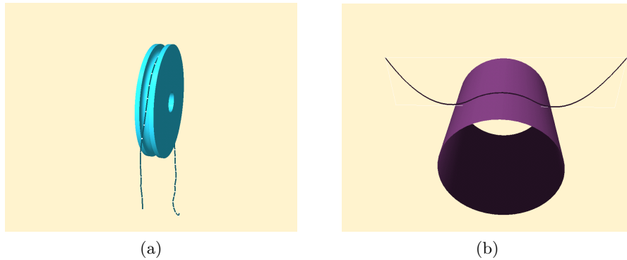
Figure 2: Snapshots of simulation using our algorithm. A stiff cable (a) falling off a pulley and (b) suspended (constrained at the end points) over a cylinder

There are some drawbacks of this method compared with a more classical approach like penalty springs. The addition of the constraint matrices \mathbf{J} and \mathbf{J}^T somewhat degrades the conditioning of the matrix. Hence the solution given by the QP is susceptible to numerical errors. Though we have proposed some tricks to take care of them - they may not work for all the scenarios. Hence more theoretical work is needed to analyze such problems. In addition, our algorithm will not handle the case of multiple collisions such as a cloth colliding with itself - we might need go through multiple QP passes which is computationally expensive in order to deal with that. Nonetheless, we hope that this method be further explored to solve the problem in hand.