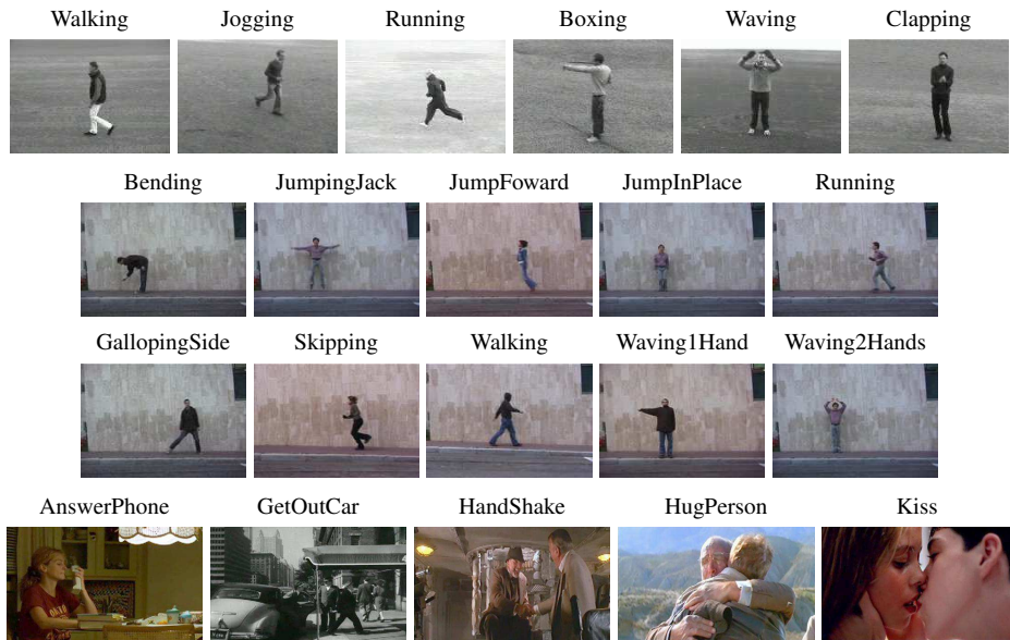
Figure 2: Sample frames from video sequences of KTH (top), Weizmann (middle), and Hollywood (bottom) human action datasets.

The Hollywood actions dataset [10] contains eight different action classes: answering the phone, getting out of the car, hand shaking, hugging, kissing, sitting down, sitting up, and standing up (see fig. 2, bottom). These actions have been collected semi-automatically from 32 different Hollywood movies. The full dataset contains 663 video samples. It is divided into a clean training set (219 sequences) and a clean test set (211 sequences), with training and test sequences obtained from different movies. In this work, we do not consider the additional noisy dataset (233 sequences).