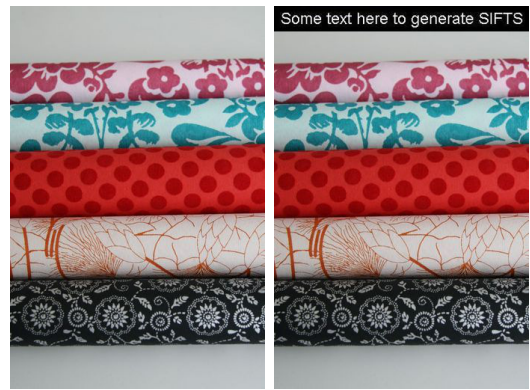
Fig. 2. Original & modified images

To demonstrate the feasibility of attacking the database part of CBIR systems, we show it is possible to conceal copies when the internals of the retrieval process is known. In this