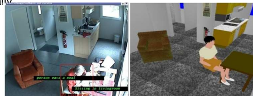
Figure 2 Recognition of “tacking meal” activity