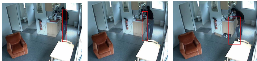
(a). Inside_kitchen (Pr=0.54) (b). Inside_kitchen (Pr=0.54) (c). Inside_kitchen (Pr=0.37)

We can control the recognition performance (sensitivity with respect to precision) by more or less strict value for the threshold. In figure 3, because of segmentation and tracking errors and noise, the crisp algorithm did not manage to recognize any event. All these vision problems affect deeply the event recognition process. Handling uncertainty, the proposed algorithm manages to detect the event with a probability of recognition Pr greater than the recognition threshold.