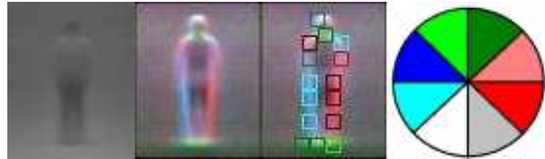
Figure 1. Mean human image with corresponding edge magnitudes and the 15 most dominant cells. From the left: the first image shows the mean human image calculated over all positive samples in the database; the second image shows the corresponding mean edge magnitude response; the third image shows this later image superposed with the 15 most dominant cells of size 8 \times 8 pixels.

We use a Histogram of Oriented Gradient (HOG) based technique to automatically detect humans in different scenes before their visual signatures are extracted for re-identification purposes. Our HOG technique is adapted from the face detection technique [1] to detect human silhouette. The detection algorithm extracts histograms of gradient orientation, using a Sobel convolution kernel, in a multi-resolution framework. The technique was originally designed to detect faces using the assumption that facial features remain approximatively at the same location. A set