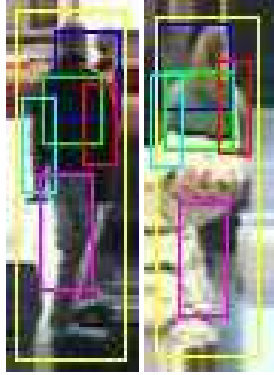
Figure 3. Illustration of the human and body parts detection results. Detections are indicated by 2D bounding boxes. Colors correspond to different body parts: the full body (yellow), the top (dark blue), the torso (green), legs (violet), the left arm (light blue) and the right arm (red).