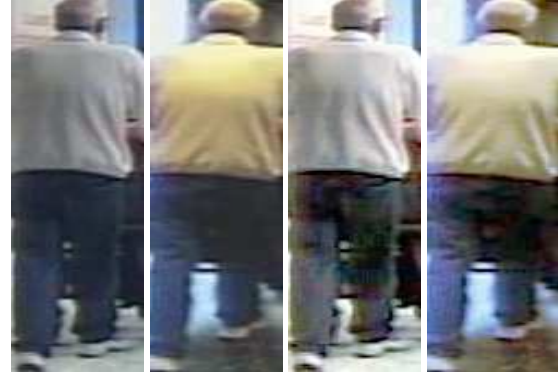
(a) original (b) original (c) normalized (d) normalized

One of the most challenging problem using the color as a feature is that images of the same object acquired under different cameras show color dissimilarities. Even identical cameras which have the same optical properties and are working under the same lighting conditions may not match in their color responses. Hence, color normalization procedure has been carried out in order to obtain invariant signature. We use a technique called histogram equalization [10]. This technique is based on the assumption that the rank ordering of sensor responses is preserved across a change in imaging conditions (lighting or device). Histogram equalization is an image enhancement technique originally developed for a single channel image. The aim was to increase the overall contrast in the image by brightening dark areas of