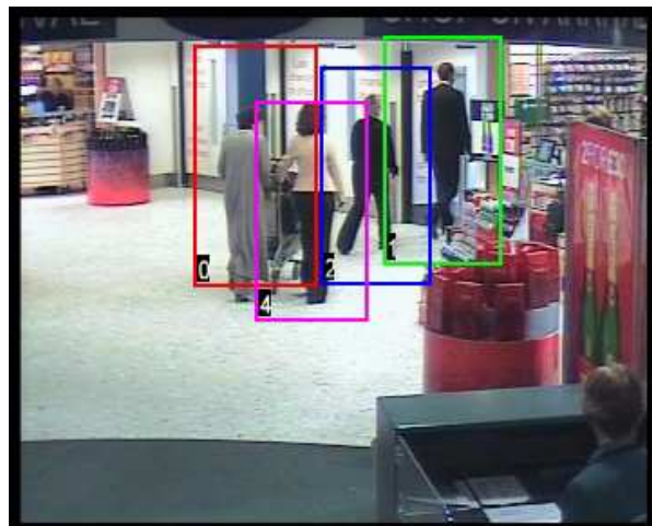
Figure 2. Examples of detected people.

of 9 non-overlapping square cells ( e.g. the right eye is located in the top left corner of a square window) were used to represent a face. However, location of human silhouette features do not remain constant in template with the varying poses ( e.g. knees are constantly changing position when walking; a shoulder changes position from walking to slightly bending when pushing a trolley).