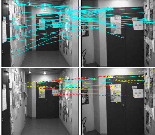
Figure 1. Top: 44 SIFT correspondences. Many outliers can be seen. Bottom: 10 inliers are retrieved with our algorithm. Please zoom in on the pdf file.

formed by a 3D homography into the y_i , and outliers are associated with uniformly drawn points into the 3D area limited by the inliers. Each point is given a random covariance which may have standard deviation up to 6 in a direction, and its position is changed with a standard deviation of 3 (compare to the size of the block: the problem is quite challenging). The table gives statistics for our algorithm (average over 10 runs) in 6 situations.