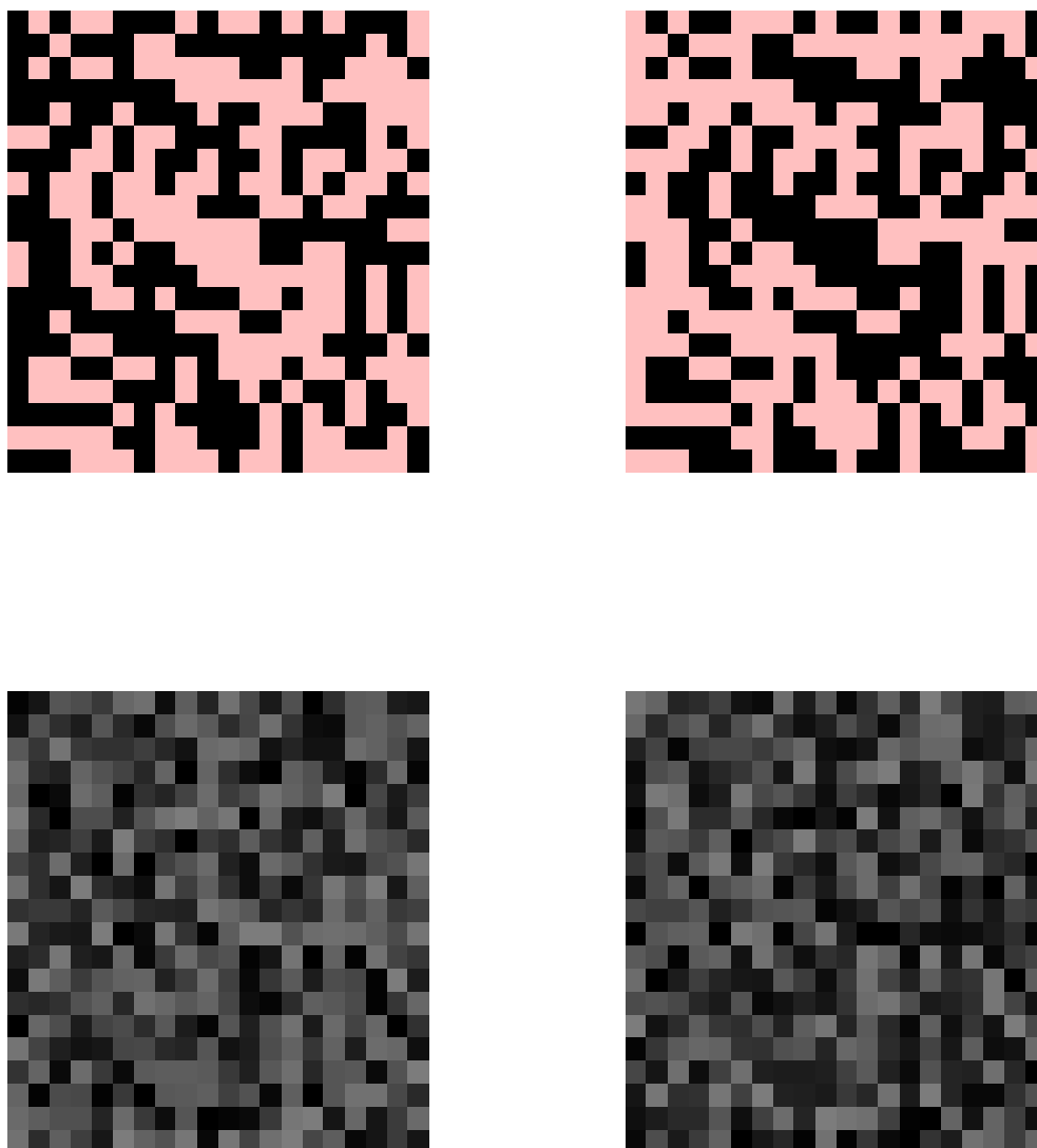
Figure 1: Realization of a(x, \omega) given by (2) (left) and the associated antithetic field b(x, \omega) (right). Top figures: a_0 \sim \mathcal{B}(1/2) ; bottom figures: a_0 \sim \mathcal{U}([\alpha, \beta]) .