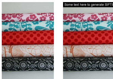
Figure 2: The original and the modified images.

modified images. This means the attacked images are further away in the feature space, offering opportunities for reducing the recognition quality of the system.