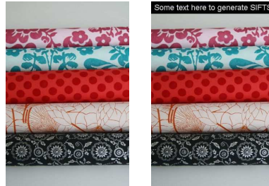
Figure 2: The original and the modified images.

modified images. This means the attacked images are further away in the feature space, offering opportunities for reducing the recognition quality of the system.