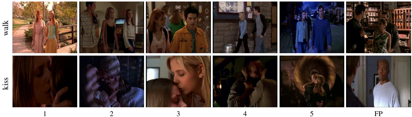
Key frames of the top 5 “walk” and “kiss” samples obtained with our iter-SVR method (FP is the first false positive - “walk”: rank 30, “kiss”: 37).

This paper presents an approach for mining visual actions from real-world videos, using both text and vision. Following recent advances on action recognition [1, 4], we use movies and their transcripts to automatically obtain video samples of visual actions. Such a system can visually discover which actions are performed and also permits to collect training data for action recognition. Similar approaches were explored to build collections of images for object classes [7] and for naming characters in images [5] and videos [3].