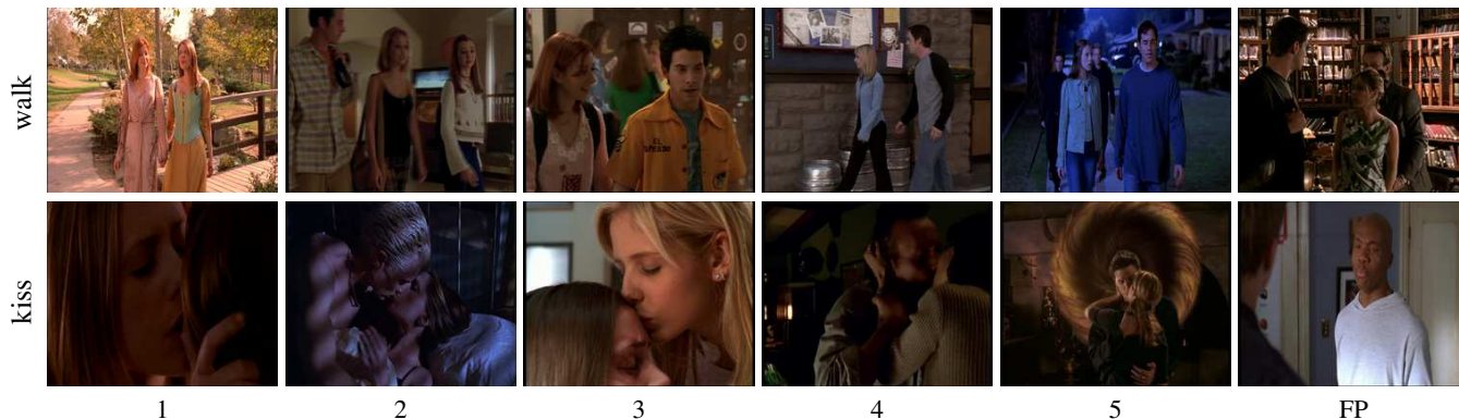
Key frames of the top 5 “walk” and “kiss” samples obtained with our iter-SVR method (FP is the first false positive - “walk”: rank 30, “kiss”: 37).

This paper presents an approach for mining visual actions from real-world videos, using both text and vision. Following recent advances on action recognition [1, 4], we use movies and their transcripts to automatically obtain video samples of visual actions. Such a system can visually discover which actions are performed and also permits to collect training data for action recognition. Similar approaches were explored to build collections of images for object classes [7] and for naming characters in images [5] and videos [3].