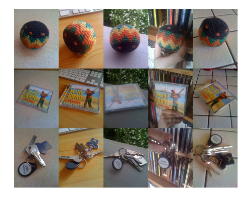
Several examples of a specially constructed objects database corresponding to the kind of objects we think an human would like to teach to its robot (everyday object, small and carryable). The images were taken with different backgrounds in order to be able to recognize objects in spite of their location.