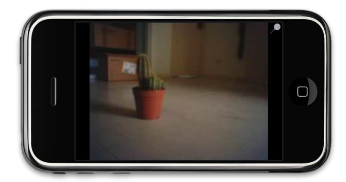
Fig. 2. We display the video stream of the camera of the robot on the screen. This allows to accurately monitor what the robot is seeing and thus really achieving joint attention situation.