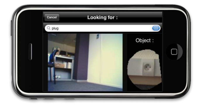
Fig. 8. Once the robot has learnt some words, the user can ask the robot to look for one, by selecting it on the looking menu.

have been developed to move the robot until it detects the searched object by using the visual bag-of-words system.