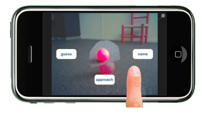
Fig. 6. When a joint attention situation has been achieved on an object, a set of actions are presented to the user, which can in particular decide to teach a name for this object

(examples are shown on the figure 5). A lot of researches have also studied how the boundaries of the object could be determined through its motion: motion based segmentation [30]. Although, this algorithm can only segment carryable or movable object. Range segmentation algorithms use images containing depth information to compute regions belonging to the same surface [31]. Of course, this approach does not allow to recognize 2D objects such as a poster. By asking the user to segment the image with a circling stroke, we circumvent all the above mentioned problems and we can deal with all the kind of objects, allowing us to work in unconstrained environments.