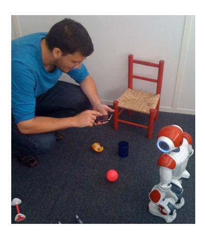
Fig. 1. Using a handheld device as a mediator object to control the movements of a social robot.

We argue that one way to help to achieve intuitively and robustly some of the functionalities presented above is to develop simple artefacts that will serve as mediators between the human and the robot to enable natural communication, in much the same way as icon based artefacts were developed for leveraging natural linguistic communication between human and certain bonobos [8]. More particularly, we argue that using mobile devices, such as illustrated in figure 1 may enable to circumvent some of theses problems. Though it may seem less natural to use a device as a mediator