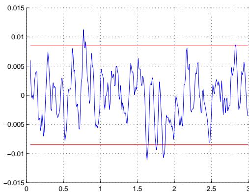
Fig. 4. Noise error contribution in the estimation of x_1 and the predicted bounds given by (18) in red.