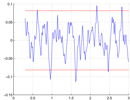
Fig. 6. Using an affine causal estimator: noise error contribution in the estimation of x_2 and the predicted bounds given by (18) in red.