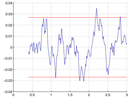
Fig. 5. Using a minimal causal estimator: noise error contribution in the estimation of x_2 and the predicted bounds given by (18) in red.