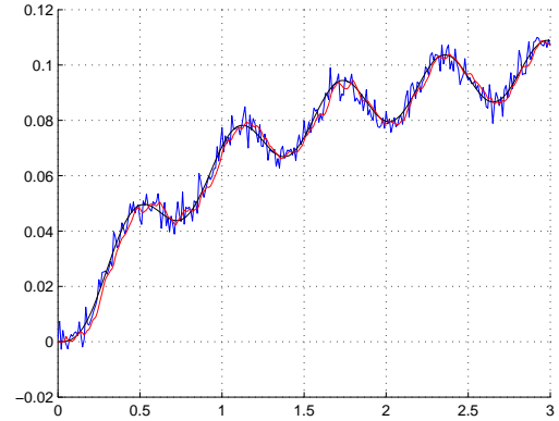
Fig. 1. Noisy output in blue, output without noise in black, and the filtered output using minimal causal estimator in red.

This system is observable ( x_1 = y, x_2 = \dot{y} see [12]). Using the above obtained estimators one can reconstruct the state by estimating y_e (obtained with n = 0 in formula (13)) which is a filtered estimation of the output, and by estimating its derivative \dot{y}_e (obtained with n = 1 in formula (13)). The Figure 1 and Figure 2 show good reconstructions despite the presence of a white noise.