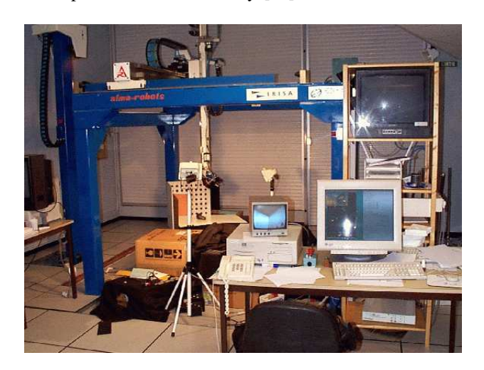
Fig. 1. Experimental system

The experimental results presented in this section have been obtained on a 6 dof eye-in-hand system (see Figure 1). All the control schemes have been easily implemented thanks to the open source ViSP library [10].